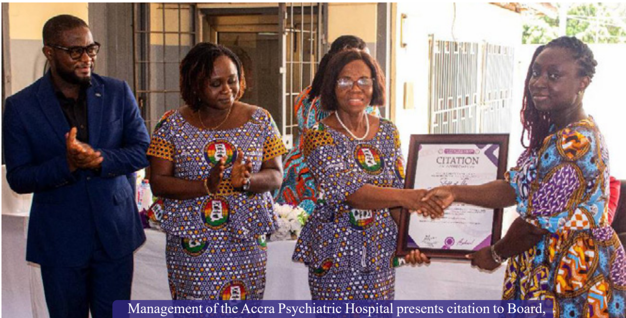
Management of the Accra Psychiatric Hospital presents citation to Board, Management and Staff of the Authority for the donation.

All the donations were made by the GSA except that made to the Accra Psychiatric Hospital which was funded by the staff through voluntary offerings they gave at the weekly Morning Devotion meetings held every Friday in 2022 and also an annual Thanksgiving event held in January 2023.