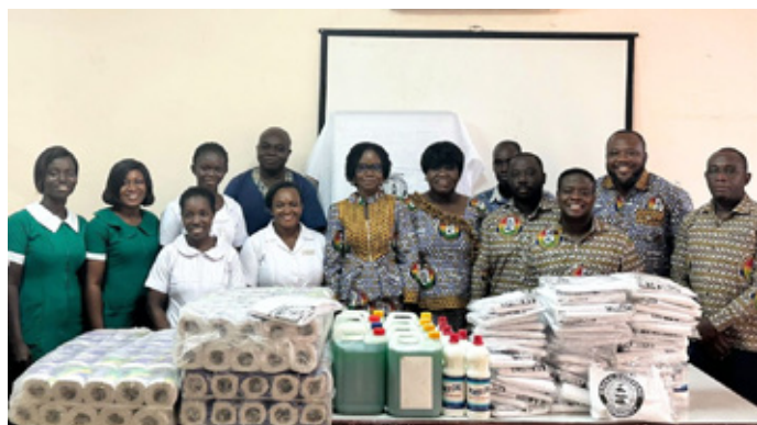
Presentation of items to the Salaga Municipal Hospital