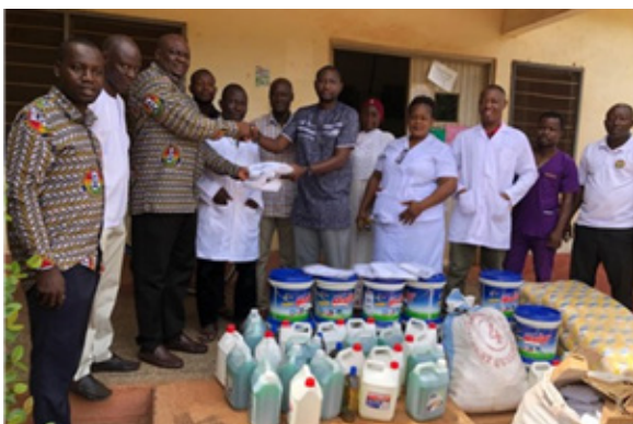
Presentation of items to the Salaga Municipal Hospital