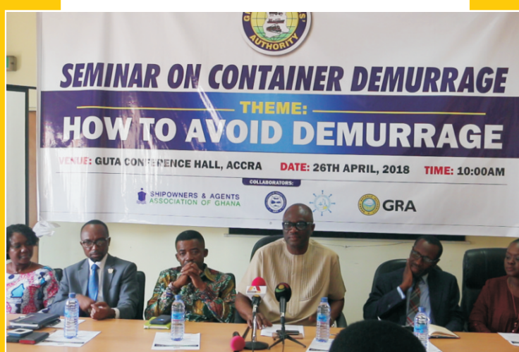
Demurrage seminar for GUTA members

Similarly, in fulfilment of its statutory obligation of negotiating charges of shipping service providers, the Authority held a meeting with Aviance Ghana Limited during the review period to negotiate their proposed tariff increase. Aviance proposed an increase in import cargo Handling Charge due to the general increase in cost of fuel and increases in other overhead costs. In arriving at the decision on the proposed increase, the Authority was guided by the fact that the proposed increase was less than the rate of inflation.