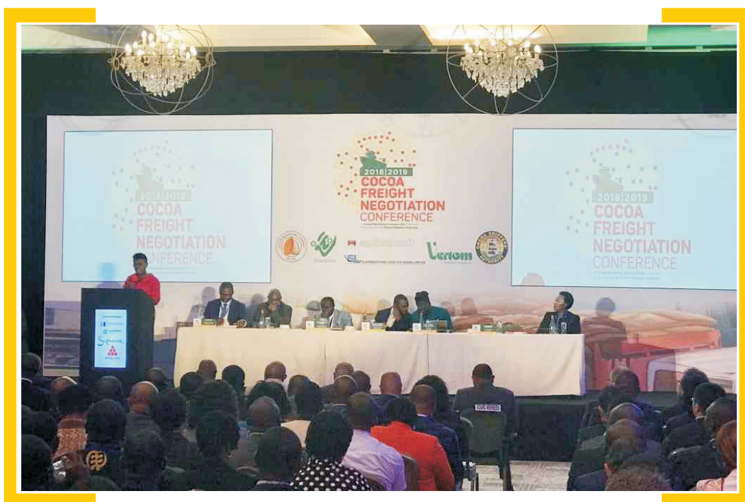
2018/2019 Cocoa Freight Negotiations

The Authority has been participating in meetings, conferences and seminars, locally and abroad to either contribute to policy formulation, resolving challenges in the country's trade and shipping industry, acquiring knowledge and building capacity. These fora have also served as platforms for the Authority to inform stakeholders of its activities. During the year under review, the Authority participated in several for a including: