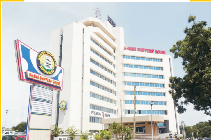
Ghana Shippers' House

sister company of Phoenix Insurance Company, which was occupying part of the vacant office space on the ground floor of the Takoradi Shippers' Centre vacated the office. A few companies expressed interest in the office space. Their proposed rent rates were however not competitive.