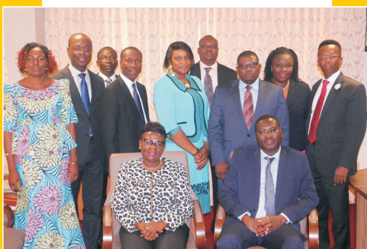
Cargo Management MoU between GSA and Burkina Faso Shippers' Council

Representatives of the Ghana Police Service and the GRA-Customs Division were also invited to provide responses to queries or