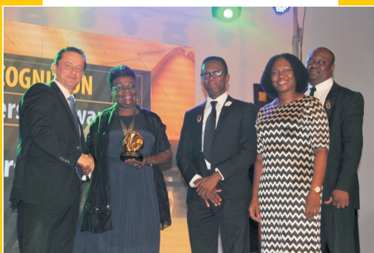
The CEO of the Authority (2nd left) receiving the plaque for the Industry Leadership Award

In a citation accompanying the Award, the Authority was commended for embarking on a nation-wide education campaign to shippers on the introduction of the paperless port project. The Award also recognised the significant contribution of the Authority towards