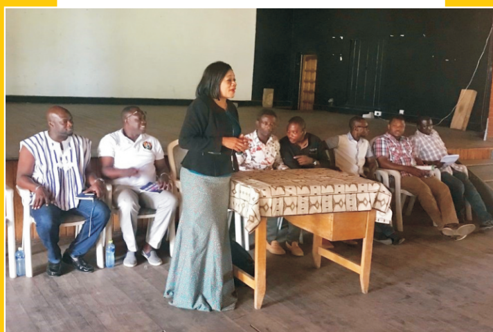
Meeting with Arts and Craft dealers