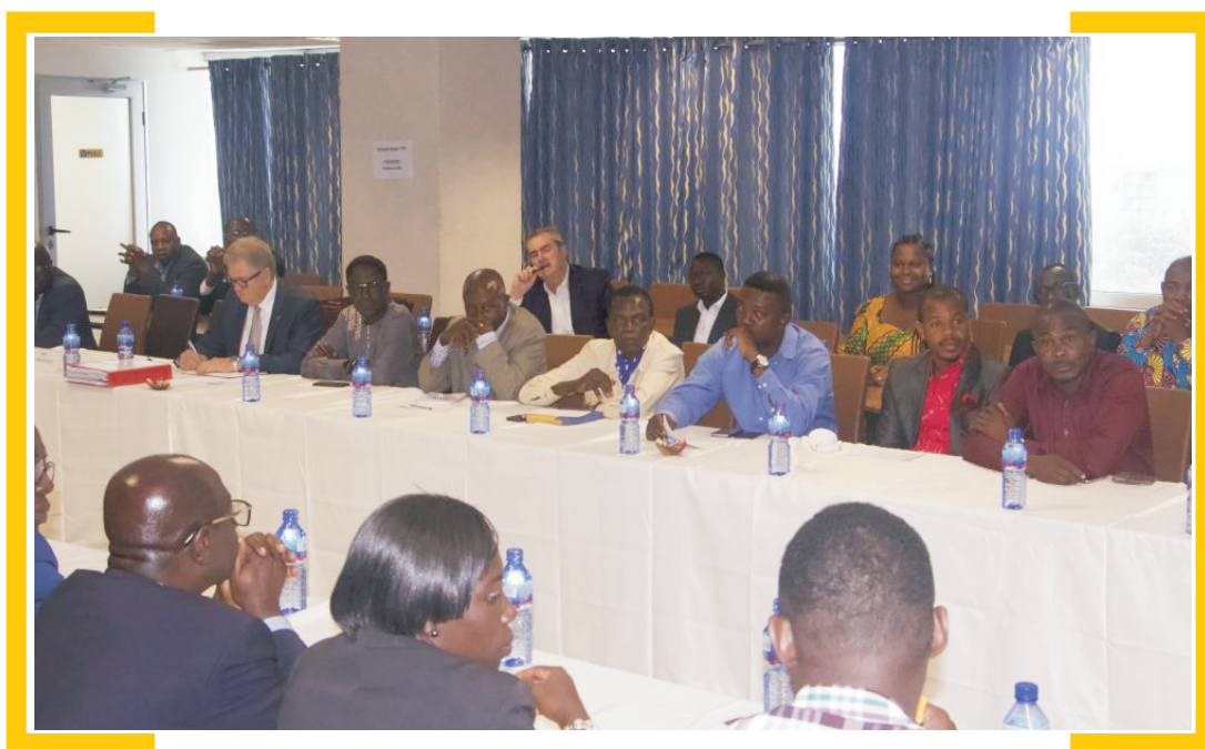
Boankra Inland Port Bidders' Conference