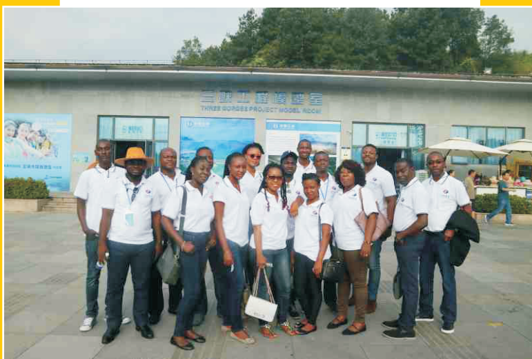
Staff day out

During the period under review, the Joint Maritime and Dockworkers Union and the Authority's Management held negotiations which led to the revision and signing of the 2017/2018 Collective Bargaining Agreements of the Authority's Senior and Junior Staff Unions.