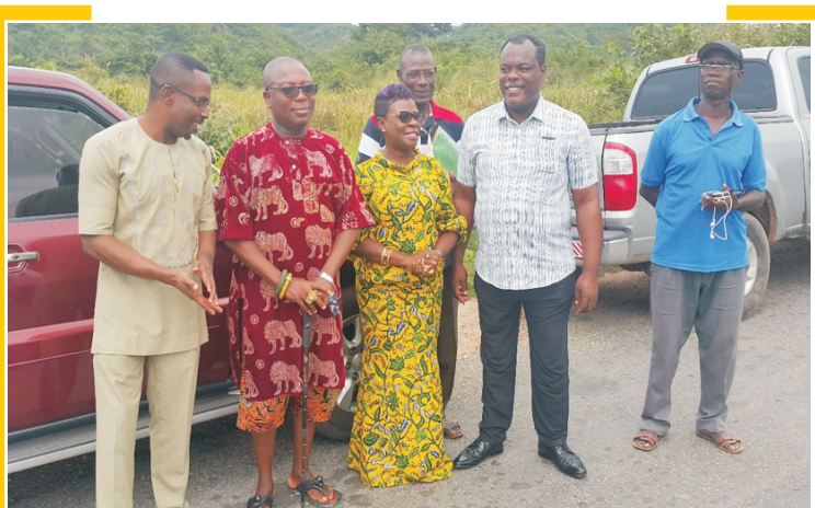
Site for proposed Akatakyiwa freight park

General back-up of all data was done twice a week, particularly cargo manifests and Declarant Data from GCNet and others.