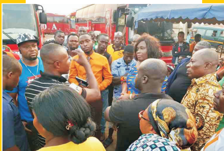
Interaction with traders at Aflao

During the period under review, the Authority participated in the National Trade and