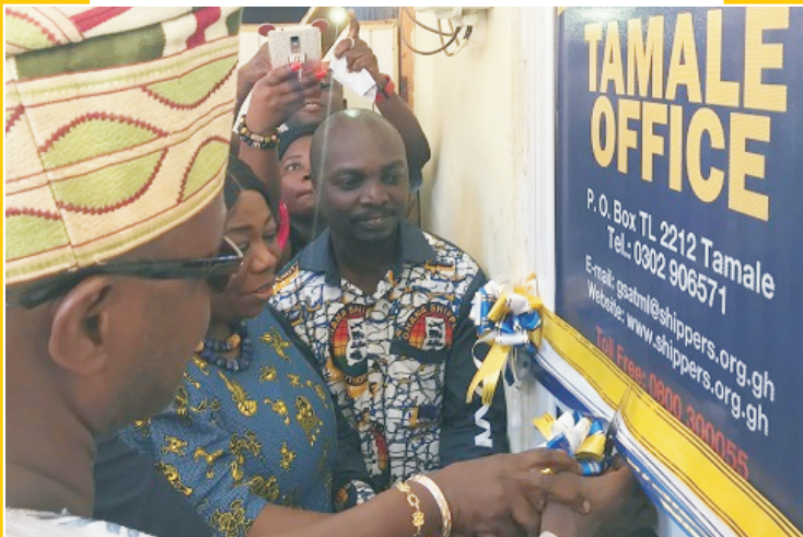
Inauguration of Tamale Office

sensitising shippers to avoid the payment of demurrage at the country's ports.