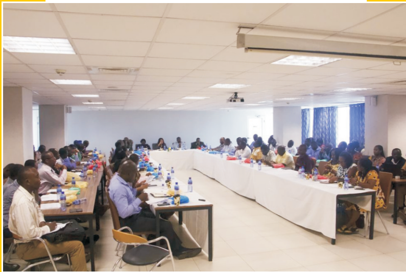
Shippers receiving education on Customs warehousing regime