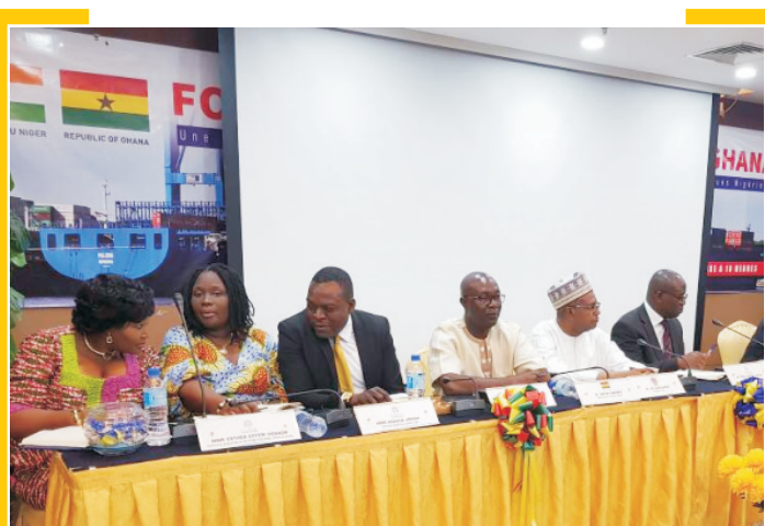
Ghana signs MOU with Niger

The Director General of GPHA, CEO of GSA and the Commissioner of GRA Customs Division took turns to assure the Nigerien delegation that no effort would be spared in facilitating transit trade between the two countries.