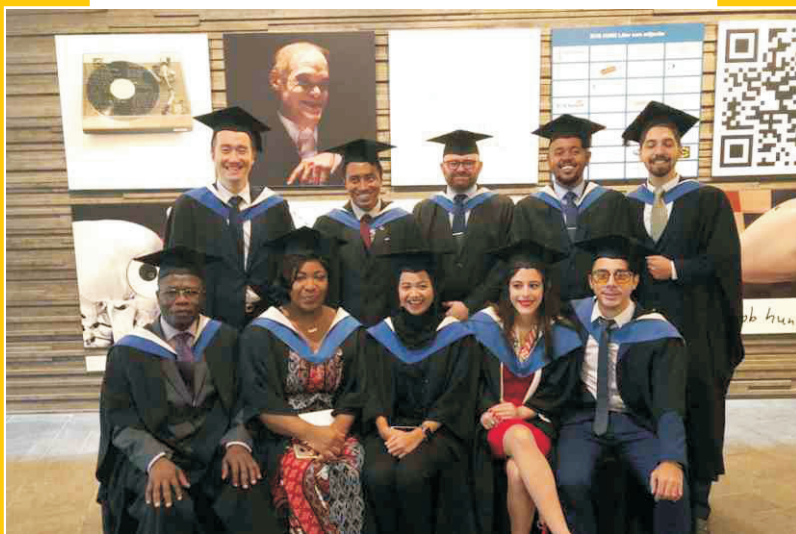
Training programme for staff

Programme in Humanities – IMO Law Institute, Malta;