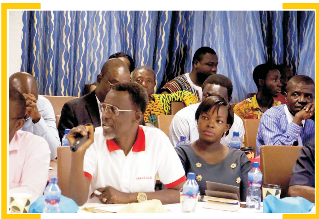
A cross-section of participants at a seminar on how to avoid payment of demurrage