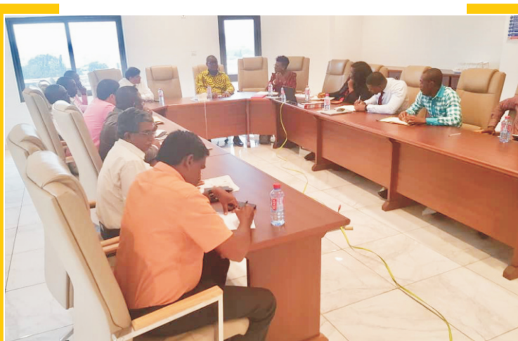
Meeting with CMAG