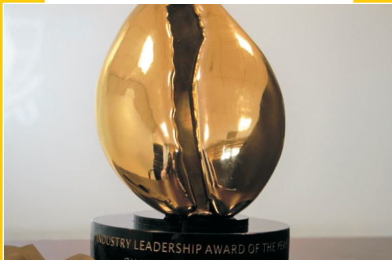
Industry Leadership Award

the Union of African Shippers' Councils' (UASC) Steering Committee in Cameroon among others.