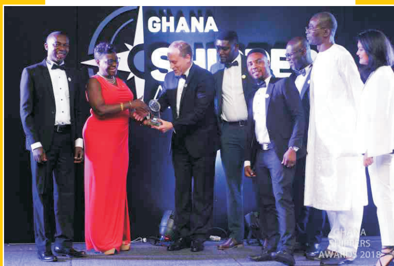
Second Ghana Shippers' Awards

The aim of the Association is to amongst other things serve as a mouth-piece of its members to protect their interest, serve as a body that will adjudicate on trade disputes and serve fisher folks by providing cold storage facilities to facilitate distribution.