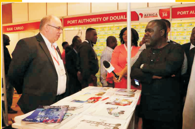
Minister of Transport, Hon. Kwaku Ofori Asiamah (right) interacting with an exhibitor at the 20th Africa Intermodal Conference