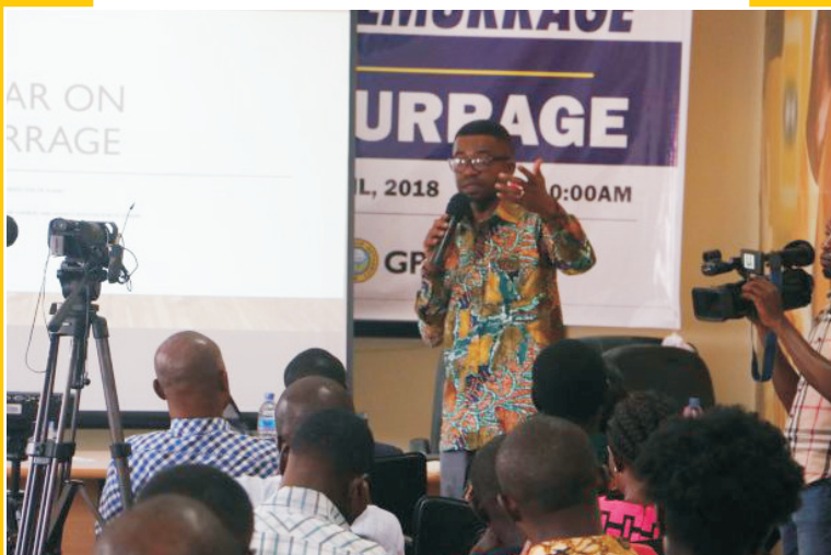
Education campaign on avoidance of payment of demurrage cost for GUTA members

year under review put together four seminars.