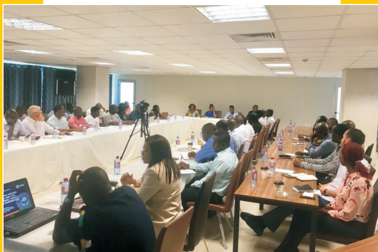
Seminar on the Harmonization of the HS Code and Mining list

International Trade (GSIT) for Bureau VERITAS made a presentation on the EasyPASS programme. She disclosed that the Bureau VERITAS was appointed by the Ghana Standards Authority to implement the Ghana EasyPASS programme in Ghana and the objective is to fast track clearance on arrival in Ghana, protect the consumer and the environment and prevent the importation of unsafe, sub-standard and or counterfeit goods.