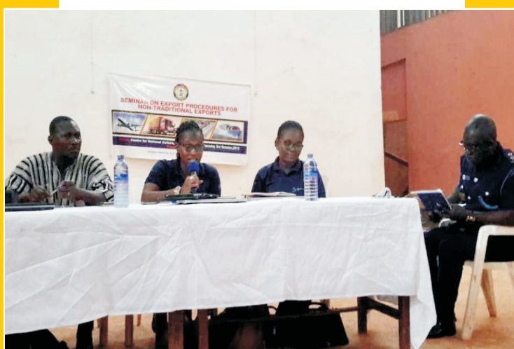
Exporters' forum for shippers in the Northern Region

Several shippers who export baskets, smocks, artefacts and other Non-Traditional Exports (NTEs) attended the event.