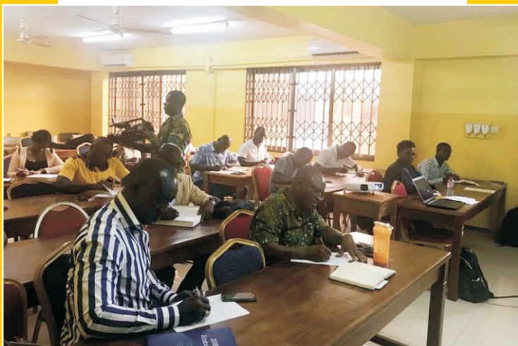
French Proficiency training for freight forwarders

week French proficiency training session for Freight Forwarders which commenced on 20th June 2018.