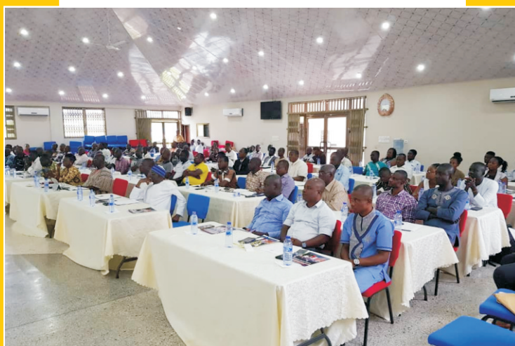
Education campaign on avoidance of payment of demurrage cost for shippers in Kumasi

As part of efforts to create awareness on how importers could avoid or reduce the amounts paid on demurrage, the Authority during the