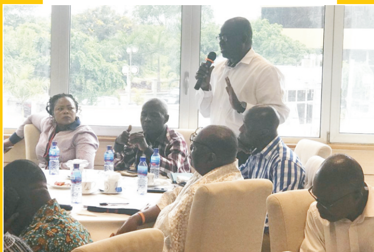
EasyPass Breakfast meeting

During the period under review, the Authority as part of its sensitization activities for shippers organized a breakfast meeting on 30th May, 2018, for shippers and members of the Greater Accra Regional Shipper Committee (GARSC) on the newly implemented EasyPASS programme. Country Manager, Government Service &