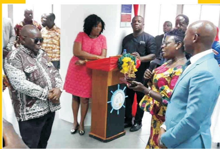
The president of Ghana, H.E. Nana Addo Dankwa Akufo-Addo's meeting with CEOs and captains of the Shipping industry

After a two-year term in office as Chair, Ghana, under the auspices of the Authority, handed over to Burkina Faso (CBC). In view of the