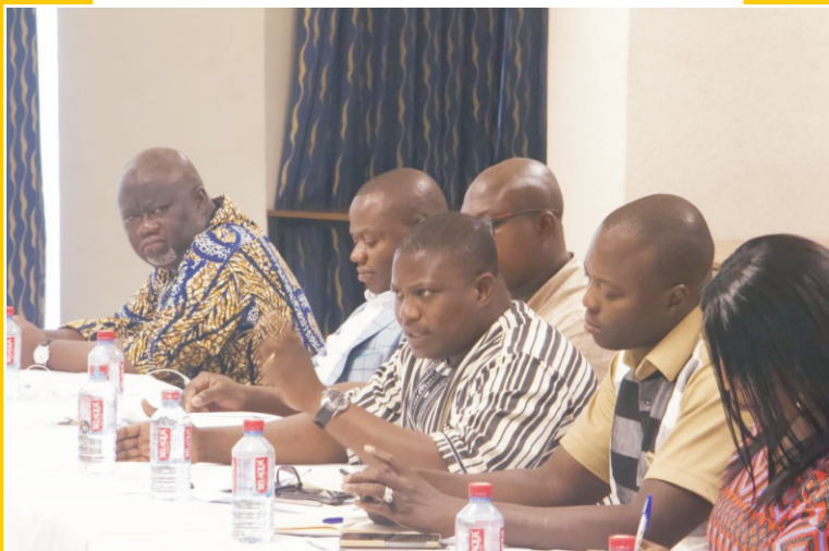
Transit Trade Shipper Committee Meetings

the trucks are parked around the facility for 3-5 days) before being served by the affixation centre.