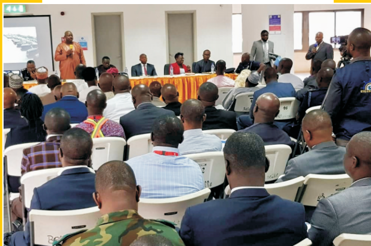
Meeting with Nigerien Operators