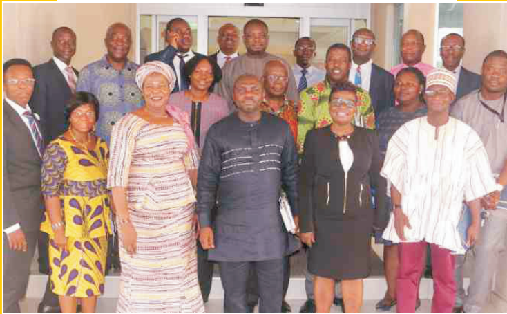
Parliamentary Select Committee on Roads and Transport

services held in Addis Ababa from 29th October to 3rd November, 2018.