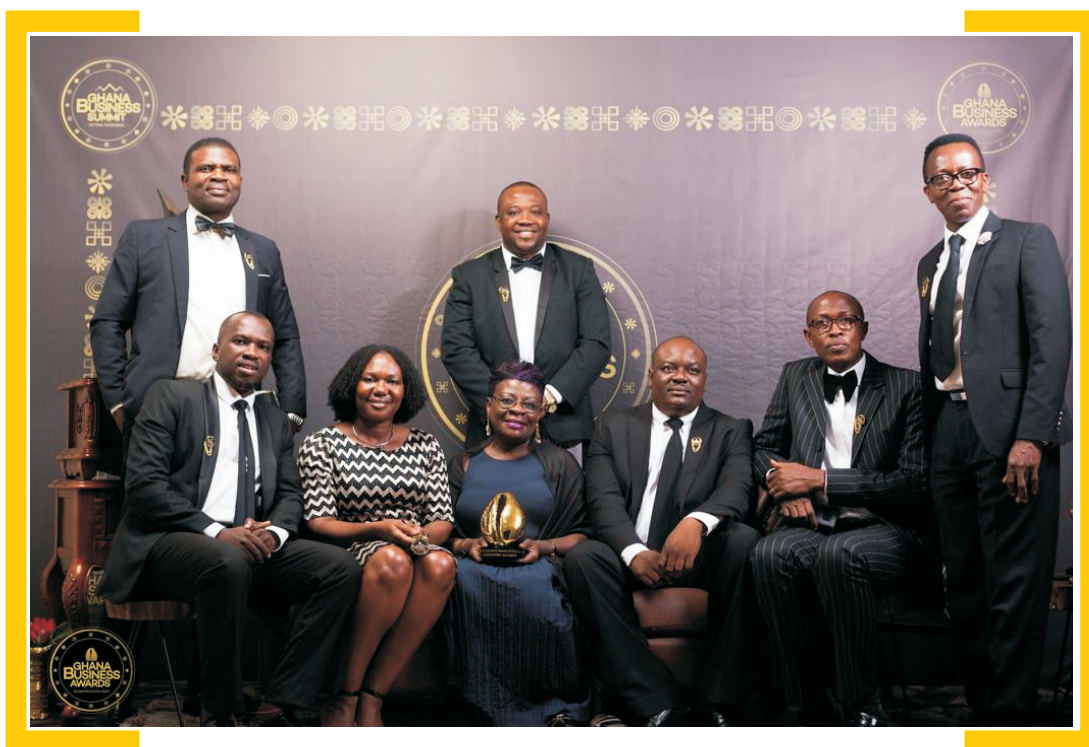
GSA wins Industry Leadership Award

The World Trade Organization (WTO) downgraded its anticipated growth outlook for global trade from the earlier 4.4% to 3.9% for the year 2018. The 3.9% growth for 2018 projects a significant decrease from the growth rate of 4.7% recorded in the year 2017.