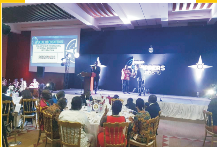
Second Ghana Shippers' Awards

In the Authority's effort to make Ghana's transit corridor the preferred choice for shippers in landlocked countries, it organized a sensitization workshop for transit truck drivers on road safety issues at the forecourt of the Black Star Line building in Tema, during the