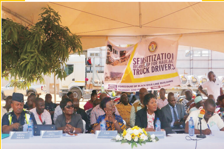
Sensitisation workshop for transit truck drivers

review period. The purpose of the workshop was to afford participants a better understanding about the road safety situation in Ghana, the spot fine regime, what constitutes drunk driving, its implications and sanctions, the regulations on axle load control and its implementation.