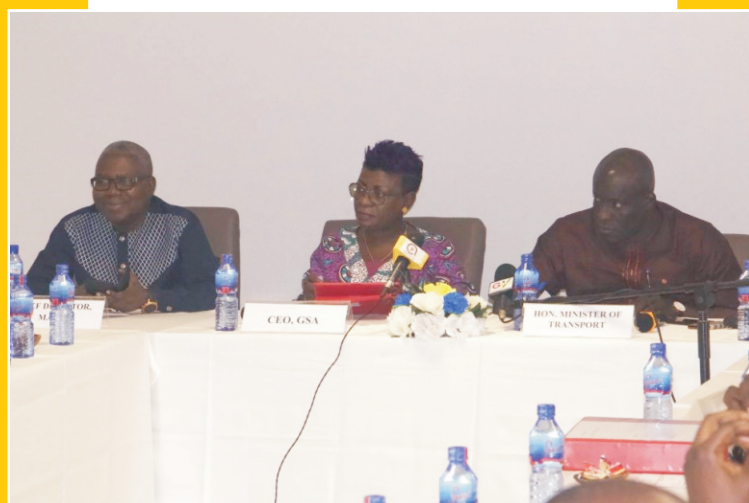
Boankra Inland Port Bidders' Conference

During the period under review, the Authority in collaboration with the Ghana Journalists