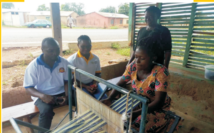
Outreach to Nandom and Lawra