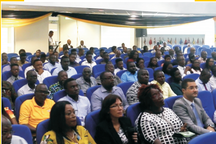
Forum on Paperless Port Review

approximately 8.0% compared to 2017. The import and export trade volumes for 2018 increased by 1.2% and 24.6% respectively compared to 2017. Total transit/transshipment trade volume increased by 0.2% in 2018 compared to 2017.