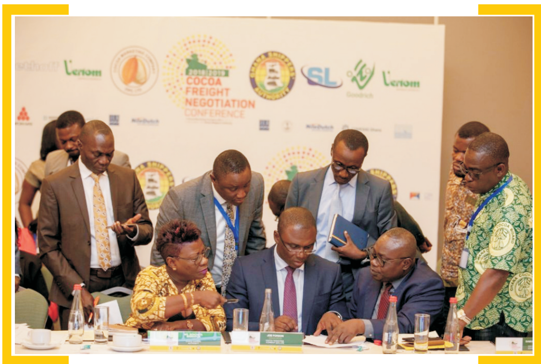
2018/2019 Cocoa Freight Negotiations