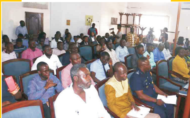
Sensitization of Stakeholders on Tariff Adjustments by the GPHA

charge of Business Development at GPHA, explained to stakeholders that the variations in charges were to ensure restructuring and realignment in the charges to reflect the economic reality prevailing in the country and the sub-region. On the average, most of the tariffs saw four (4) per cent increment in dollar terms over the previous charges.