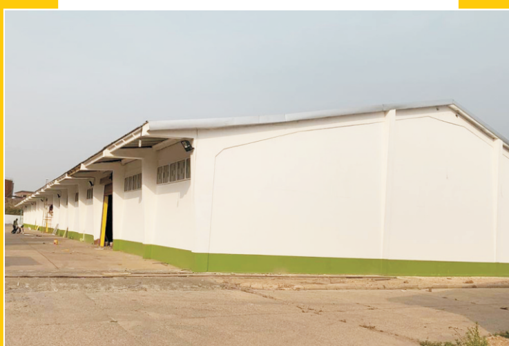
Authority's warehouses in Tema

The Authority also signed a tenancy agreement with Available Care Ghana Ltd to occupy three of the warehouses in Tema for a period of ten (10) years. As part of the agreement, the company will pre-finance the renovation of the warehouses allocated to it.