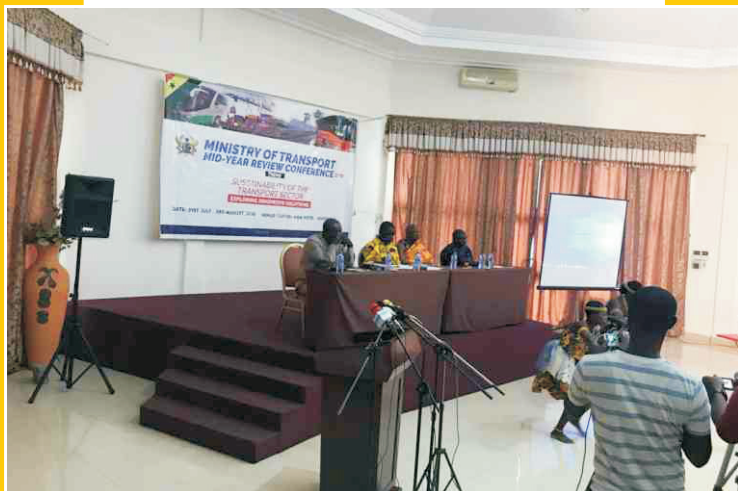
2018 Mid-Year Review

The journalists received education on topics such as: The Effect of Demurrage on the Cost of Doing Business at the Ports; Improving Trade Facilitation via Port Expansion and Efficiency; The Implementation of Paperless Transaction in Ghana - An Impact Assessment on Cargo Clearance at the Ports and Transit Trade through Ghana's corridor.