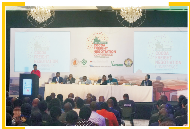
2018/2019 Cocoa Freight Negotiations

GPHA were tasked to urgently undertake a study of the neighbouring ports for a comprehensive report and appropriate recommendations.