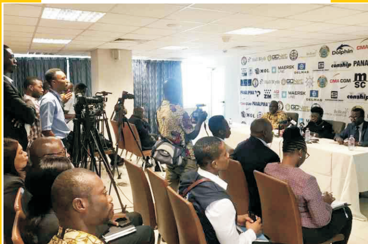
Shipping Quarter and Outlook

Transport Facilitation Committee's Joint Technical Committee at Akanu in the Volta Region. It was to discuss issues regarding the operations and management of the joint Border Post of Akanu-Noepe.