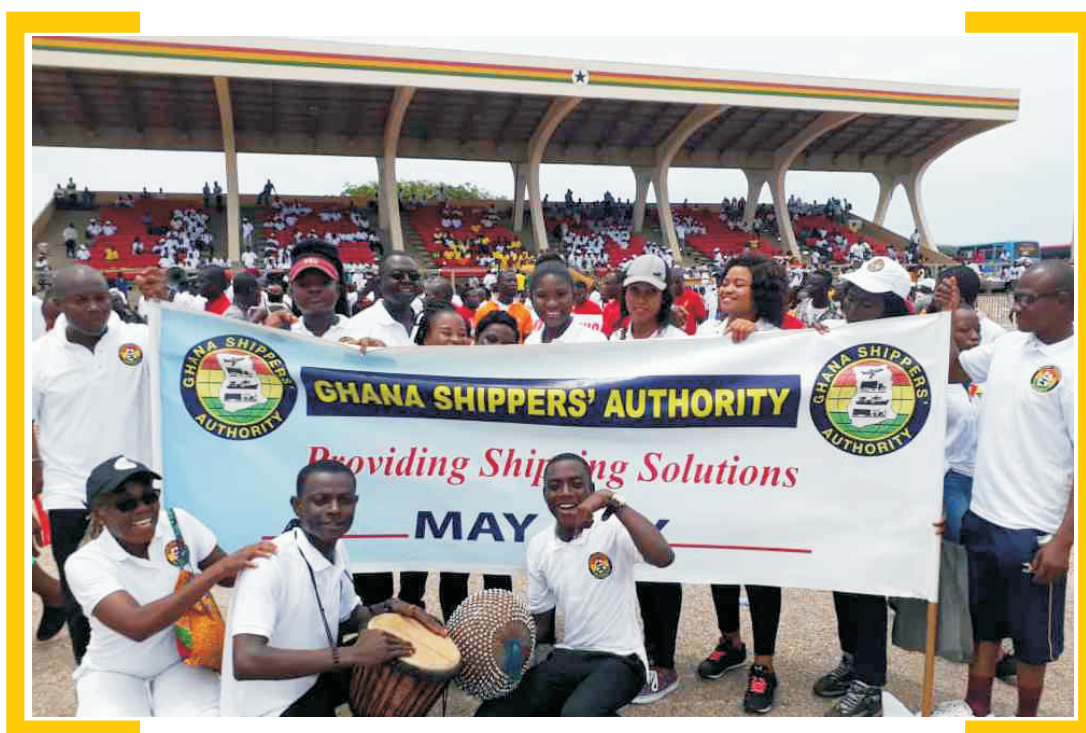
May Day celebration

The Authority's plans and programmes in relation to human resource and administration received deserved attention during the period under review. This contributed to organisational effectiveness in several ways such as employee commitment, improved productivity, customer care and job satisfaction.