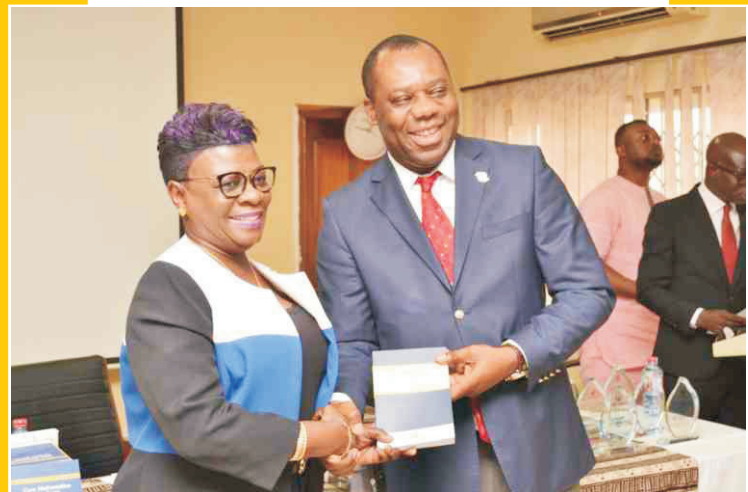
Donation of a copy of the Free SHS Core Mathematics Revision Guide textbook to the Minister for Education, Dr. Matthew Opoku-Prempeh