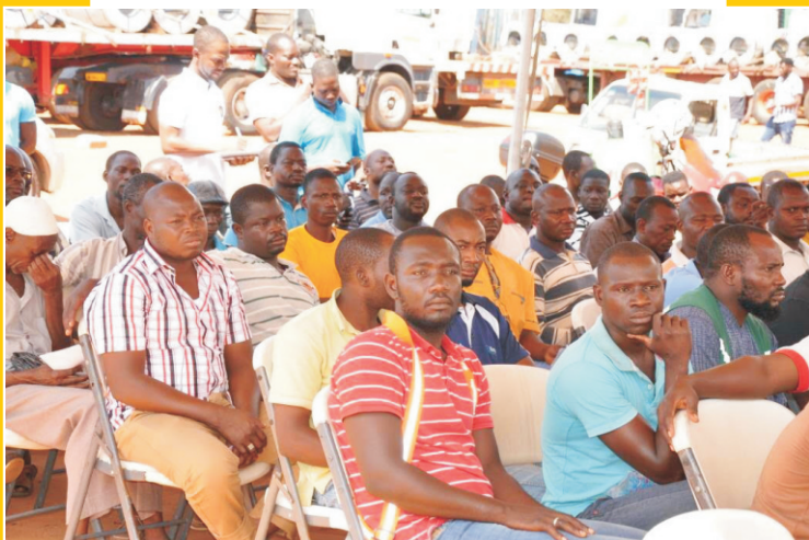
Sensitisation workshop for transit truck drivers

of Transport will be contacted to sanction the formation of the Council of Transport Union.