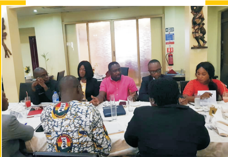
Meeting with Executives of GIFF

The global nature of ocean shipping compels the Authority to participate in international meetings, conferences and workshops. During the period under review, the Authority participated in the 11th General Assembly of the Union of African Shippers' Councils (UASC) in Burkina Faso, the extra ordinary session of