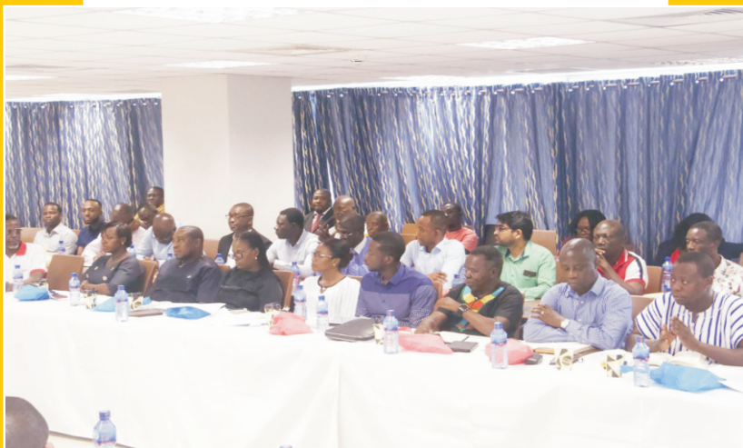
Seminar for shippers on Hazardous and Electronic Waste Control and Management