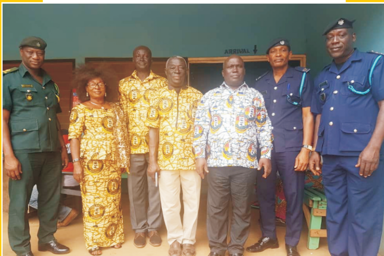
Outreach to Sampa area which is close to La Cote d'Ivoire