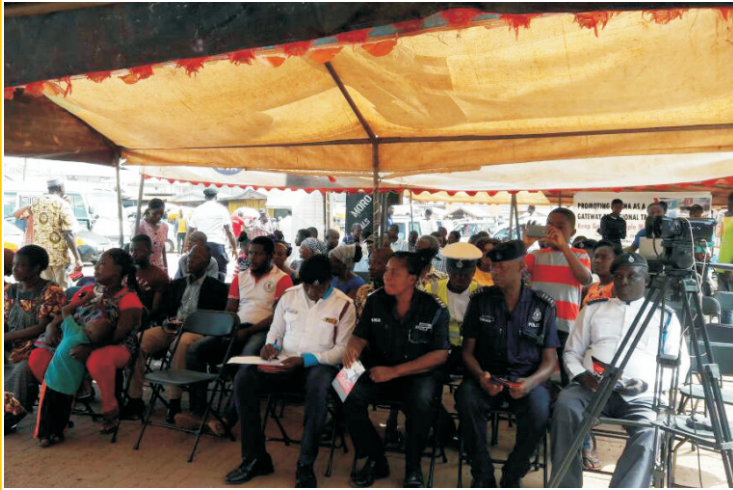
Education for E-platform

clarifications that may be required by the meeting.