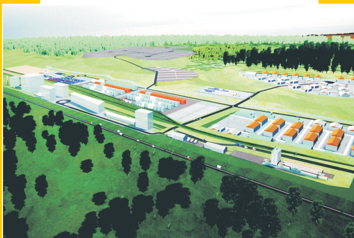
Artist impression of the Boankra Inland Port

Africa Rail withdrew from the process and accordingly did not pick up the RfP documents.