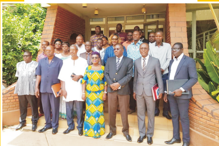
A group photo after the signing ceremony with the Burkina Shippers' Council in Ouagadougou

To facilitate transit trade on the Ghanaian corridor, the Authority during the period review signed a Memorandum of Understanding (MoU) between its Burkinabe counterpart, Burkina Shippers' Council (CBC) and Niger Shippers' Council.