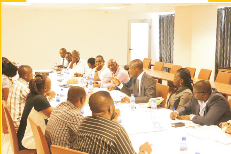
Transit Trade Shipper Committee Meetings

ships that called at the Tema and Takoradi ports, allocation of vessels to stevedores and declaration of Estimated Time of Arrival (ETA) of import and export vessels.