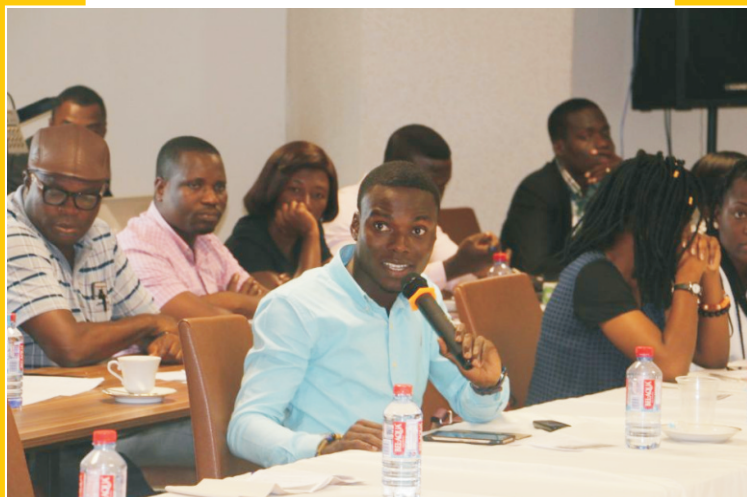
Maritime Seminar for Journalists

Association (GJA) organised the sixth Maritime Seminar for journalists on 4th September, 2018. It was under the theme, “Contemporary Trends and Developments in Ghana's Shipping Industry”. The seminar sought to build the capacity of journalists and improve their knowledge on shipping issues to enable them give accurate reportage in the media to shippers and the general public.