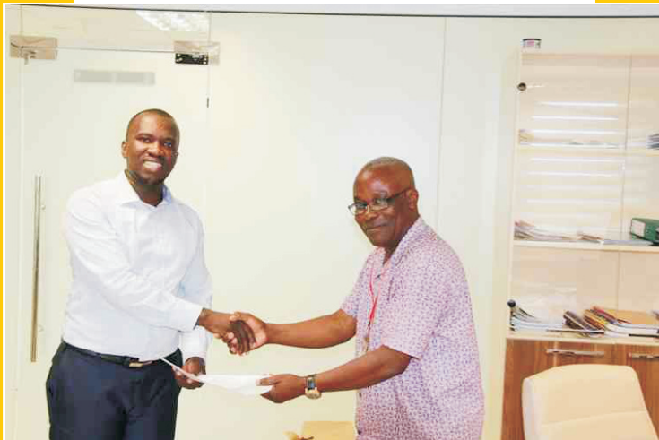
Support to GNA